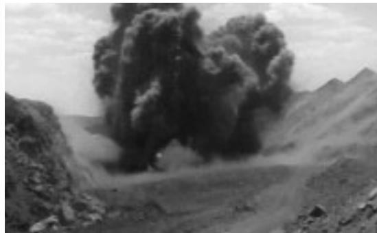
Mine blast at Black Mesa.

"You can't make roads, you can't make anything without tearing into a mountain; it's just impossible. That's how we make things. That's our culture." —DARRYL LINDSEY, MINER