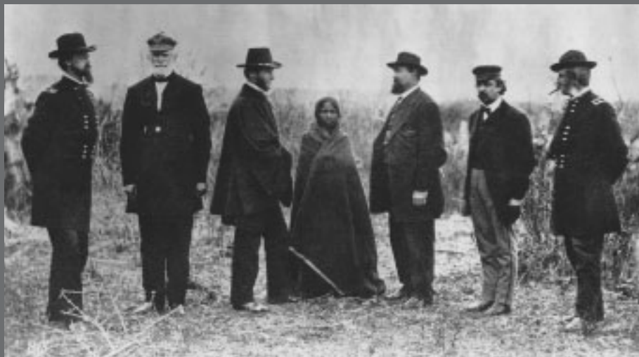
NATIONAL ANTHROPOLOGICAL ARCHIVES, SMITHSONIAN INSTITUTION