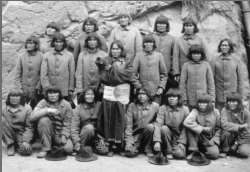
SOUTHWEST MUSEUM, LOS ANGELES

Many Hopis refused to go along with government privatization of land and refused to send their children to schools where the Hopi language was banned and only English was taught. These Hopi men, known as “Hostiles,” were imprisoned at Alcatraz in 1895 for resisting government edicts.