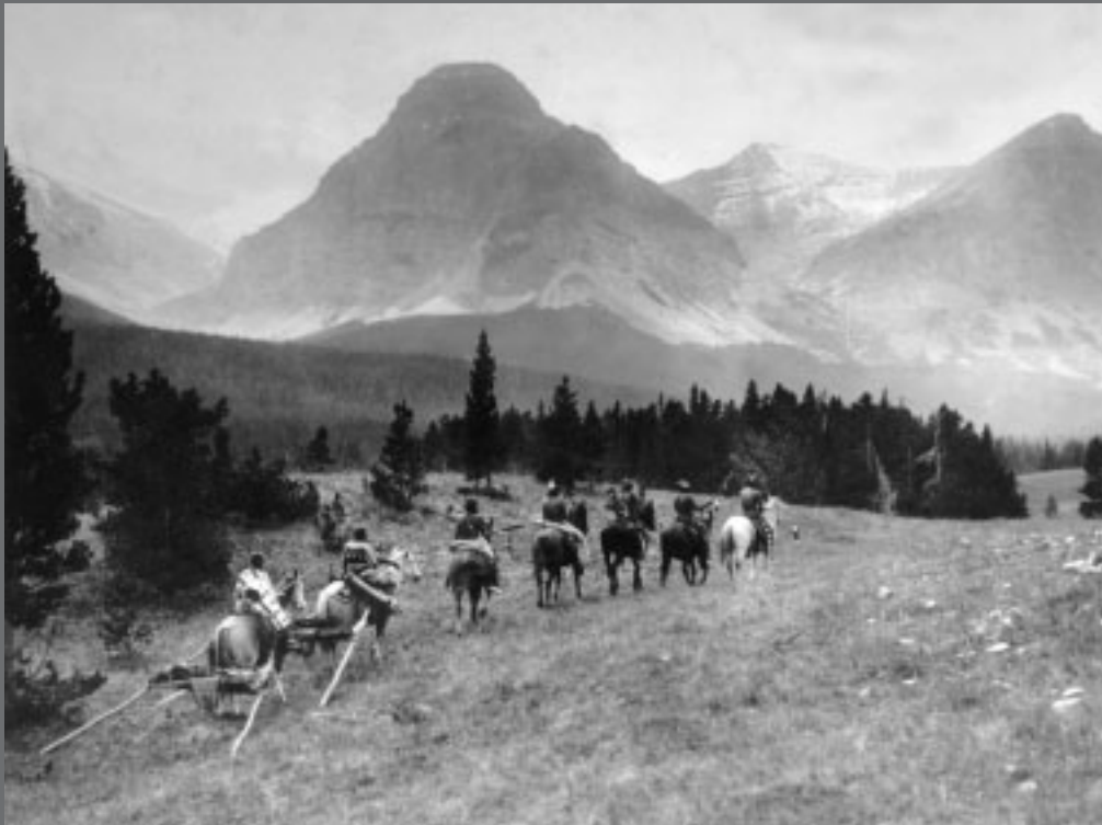
NEW YORK HISTORICAL SOCIETY