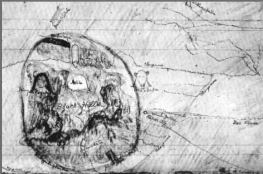
© 1967 & 1995, UNIVERSITY OF NEBRASKA PRESS