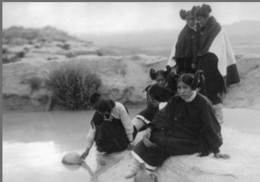
NORTHERN ARIZONA UNIVERSITY CLINE LIBRARY (NAU.PH.93.38.1)

THE HOPI BELIEVE they violated a spiritual covenant to protect their homeland when they leased water to Peabody Coal Company for money. The water, a free and sacred resource that they promised to respect and take care of through ceremony, now has become a commodity—something to be bought and sold. What are the differences between the Hopi view of the water cycle and the view of Western science and corporations?